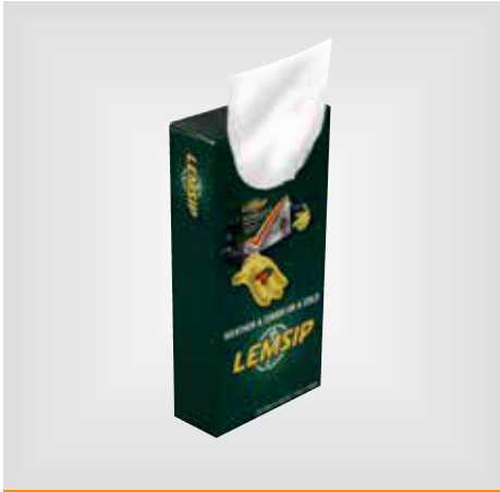
Pocket Carton Tissue Box

Box Size: 12,5x6x2,5(h) cm Contents: 205x205 mm , 3 ply 100% cellulose 10 tissues