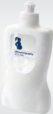
Ultrasonography & ECG Gels