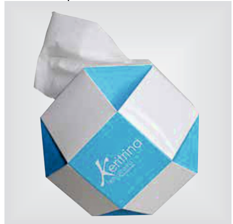
Ball Tissue Box

Box Size: 9x9x11(h) cm Contents: 150x205 mm , 2 ply 100% cellulose 50 tissues