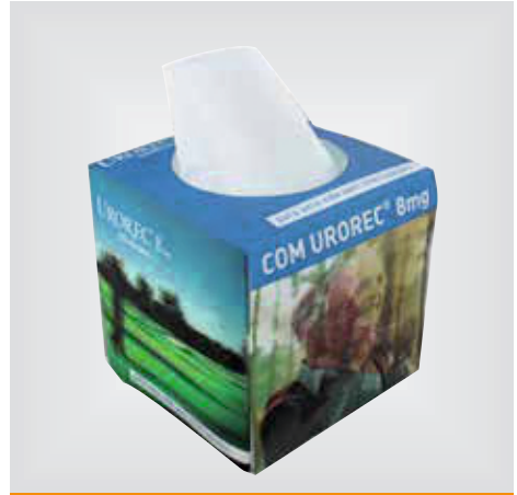
3D Lenticular Tissue Box

Box Size: 12,5x6x2,5(h) cm Contents: 205x205 mm , 3 ply 100% cellulose 10 tissues