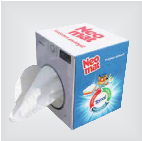
Washing Machine Tissue Box

Box Size: 10x10x10 (h) cm Contents: 150x205 mm, 2 ply, 50/60 tissues Material is lenticular , deep and movement effect are possible on artwork.